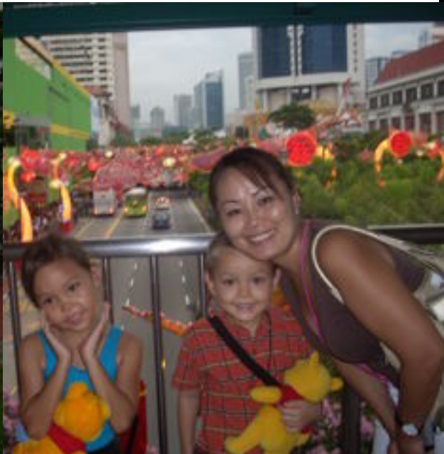
Mom and youth-units in Chinatown