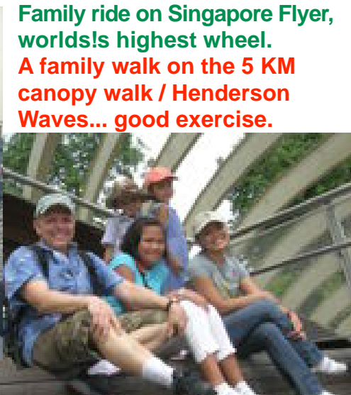
Family ride on Singapore Flyer, worlds! highest wheel. A family walk on the 5 KM canopy walk / Henderson Waves... good exercise.