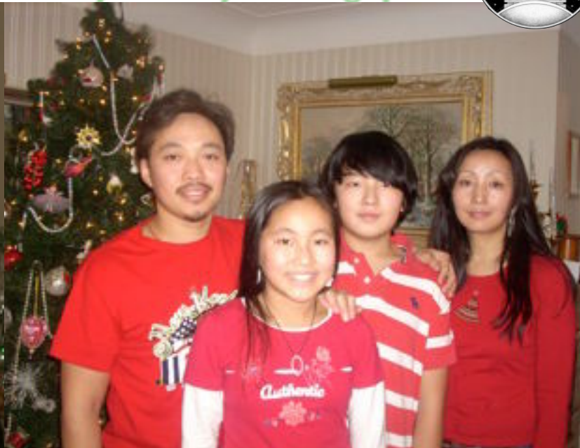
Man I love my bro's stash! And all in RED!